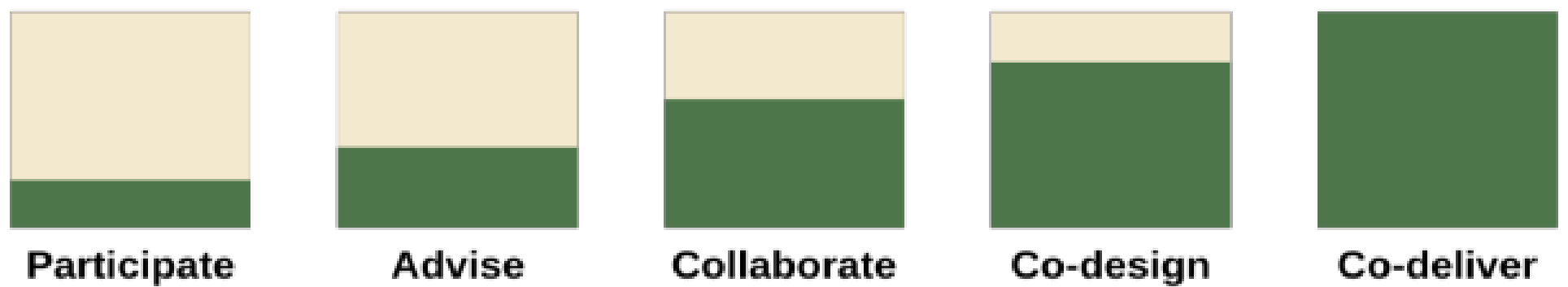
Figure 1 - Levels of engagement 2

experience is intentional, creating space for different levels of participation and recognising diverse ways of contributing and connecting. Survivor Connections' Levels of Engagement framework 3 utilises a spectrum of contribution based on levels of inclusion, ranging from more consultative to more collaborative approaches (Figure 1). In this project, people with lived experience engaged at all levels, in three different contexts of participation: